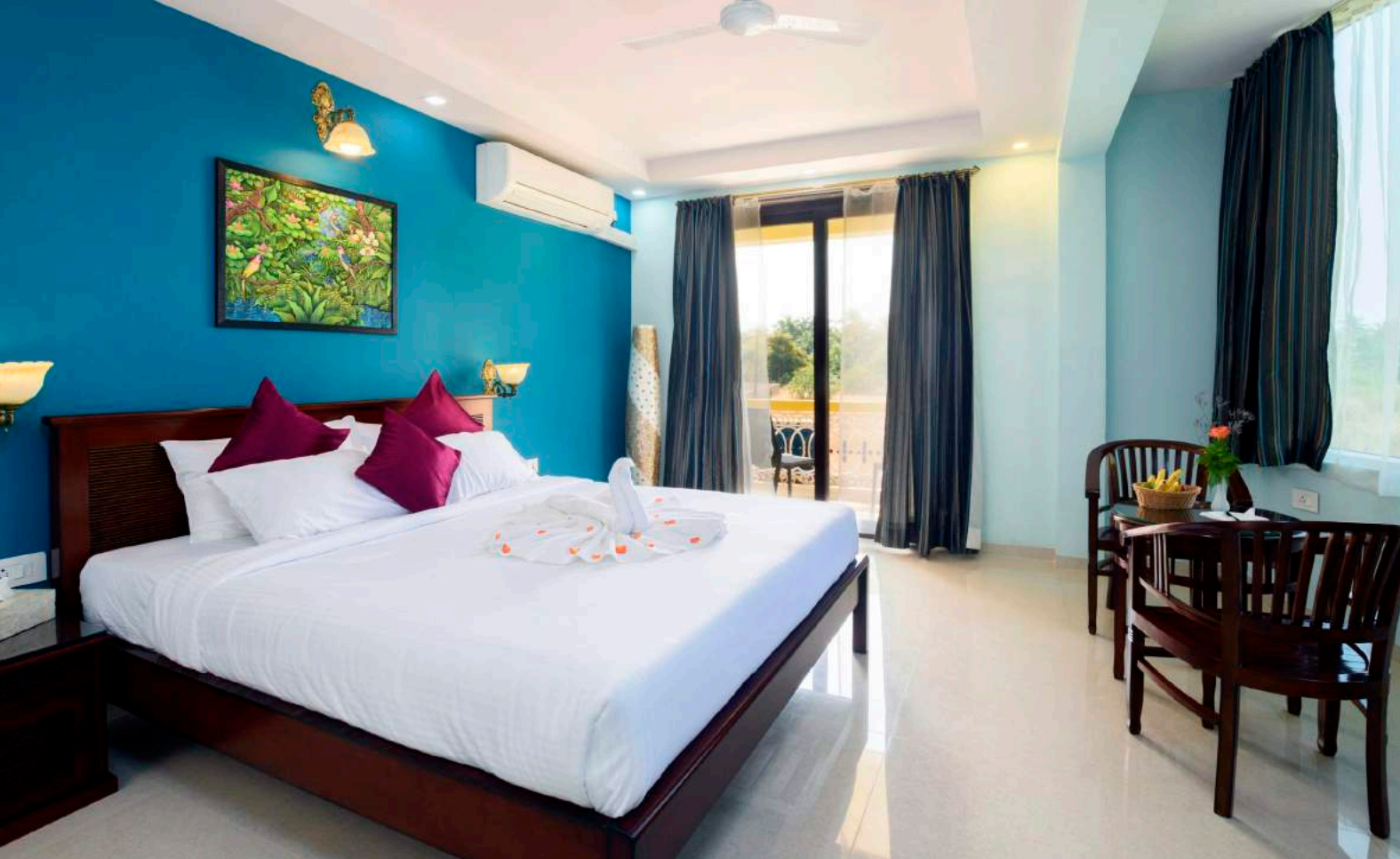
Delux Garden View Room