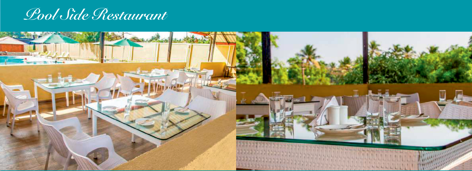
Pool Side Restaurant